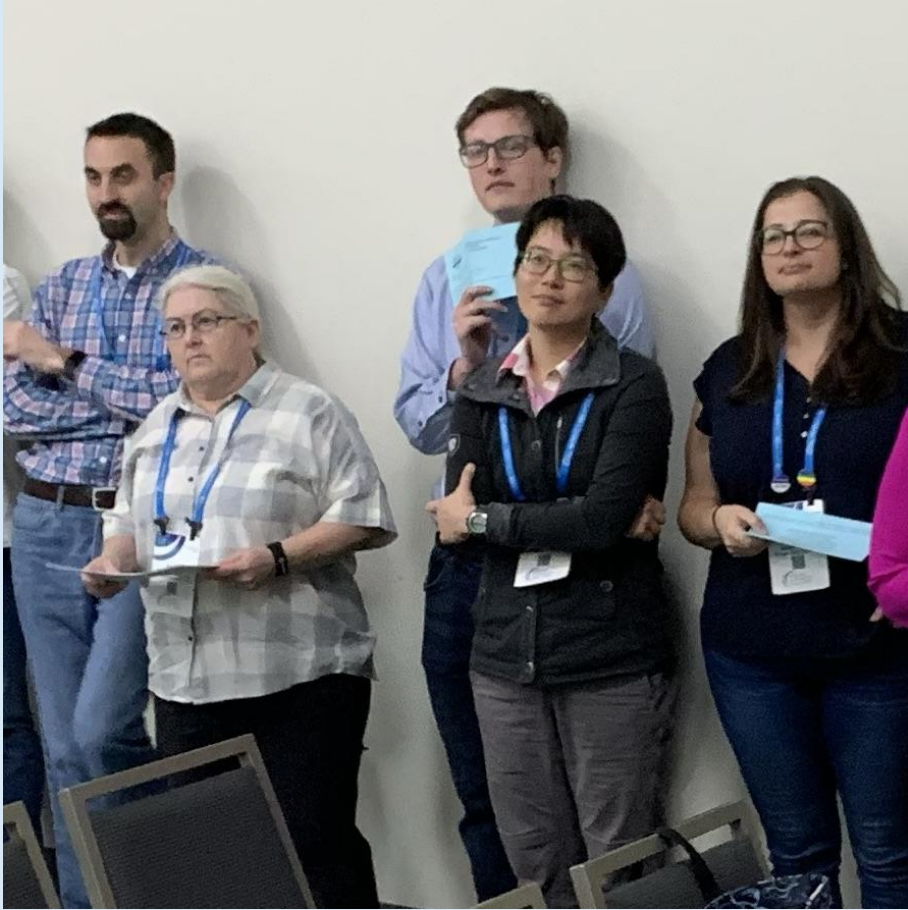
OOIFB Town Hall, Ocean Sciences Meeting, 2020.